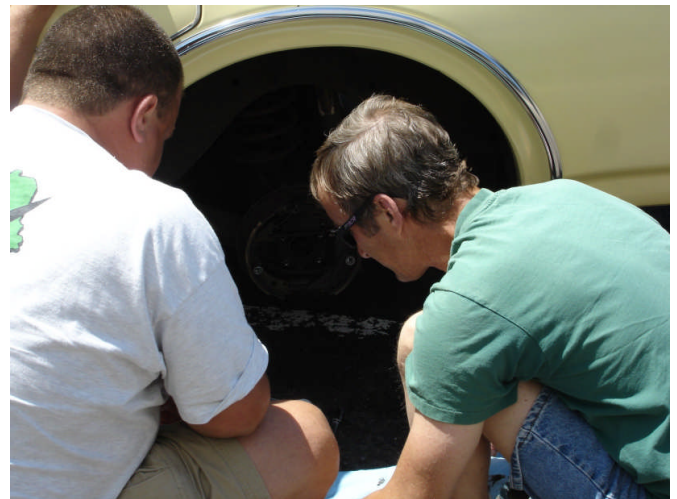
A little luck, a little patience and some good friends got this wagon back on the road!

While there I bought a new axle bearing and had a garage press it on and put some welds next to the retainer to keep it from coming off. Thought it might be good to have it as a spare for the ride home, but it wasn't needed. I also replaced the AC compressor belt.