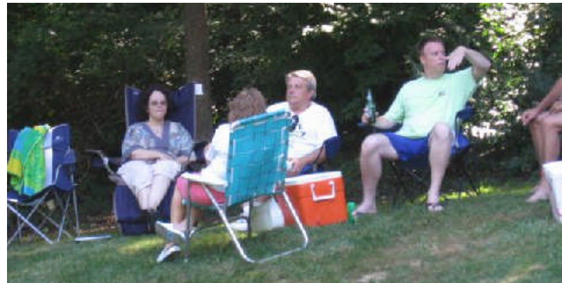
Good food, good friends, good cars, great fun!

While some long distance members chose to bring their daily drivers, many of us pulled the car covers and dusted off the toys for one last run prior to the OCA Na-