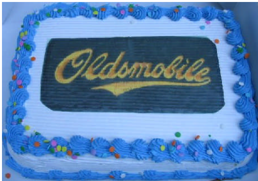
The Alessandrini's brought a unique cake!