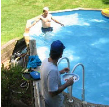
Relax at the food table or in the pool, you had your choice!