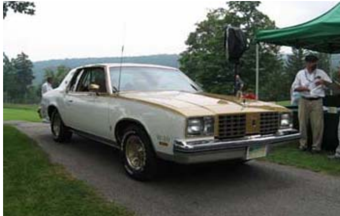
Gene Miller's '79 Hurst Olds At the medal stand at Stratton Mountain, VT

This show did not fit into the mold of a stereotypical car show venue. The competitors were lined up on the spacious and manicured fairway of Stratton's famous golf course. There was no asphalt in sight. Show organizers requested that once vehicles were cleaned for show that all hoods and trunks be closed so that the cars could be enjoyed in their natural state. The blare of rock 'n roll was