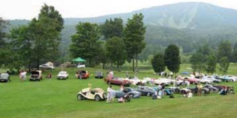
Stratton Mountain Ski Resort looms over the show field. Best of show winner '47 MG TC is visible in the foreground.

In the end the skies never did open up and the event somehow ran its course with only a few sprinkles hitting the hoods of the participant cars. The cloud cover kept the temperatures tolerable and made for glare-free viewing conditions. Look for a complete report in a future edition of Hemmings Motor News. RR