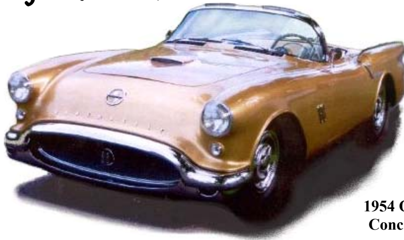
1954 Olds F88 Concept Car

Largest All Olds Show on the East Coast!